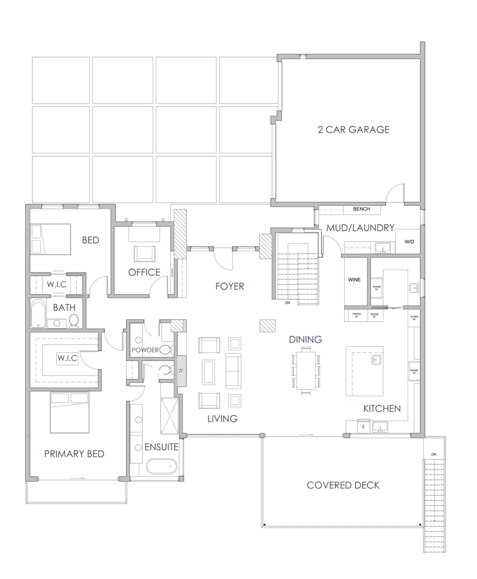
MainLevel 2456 Sq.Ft*