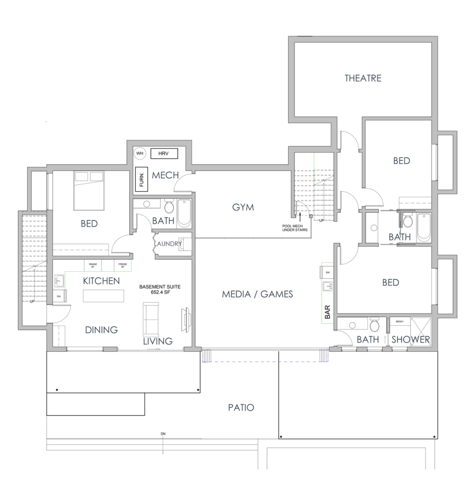
Lower Level 2483 Sq.Ft*