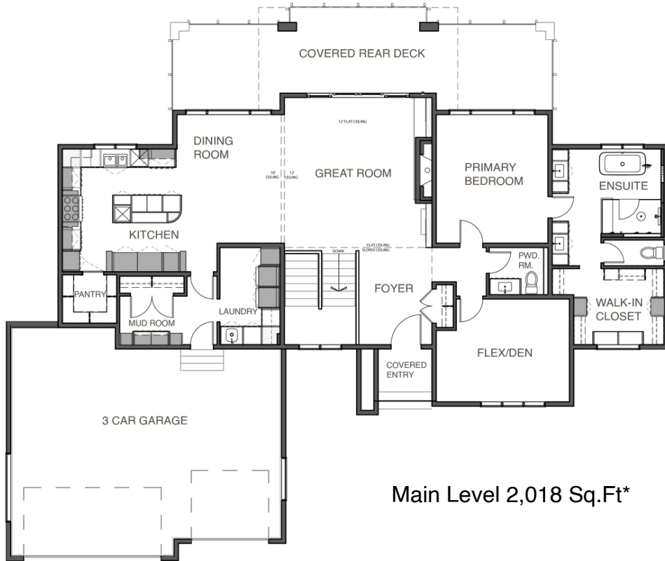
Main Level 2,018 Sq.Ft*

3 Bedrooms + Den, 3 Bathrooms 3 Car Garage 3494 Sq.Ft* Indoor Living