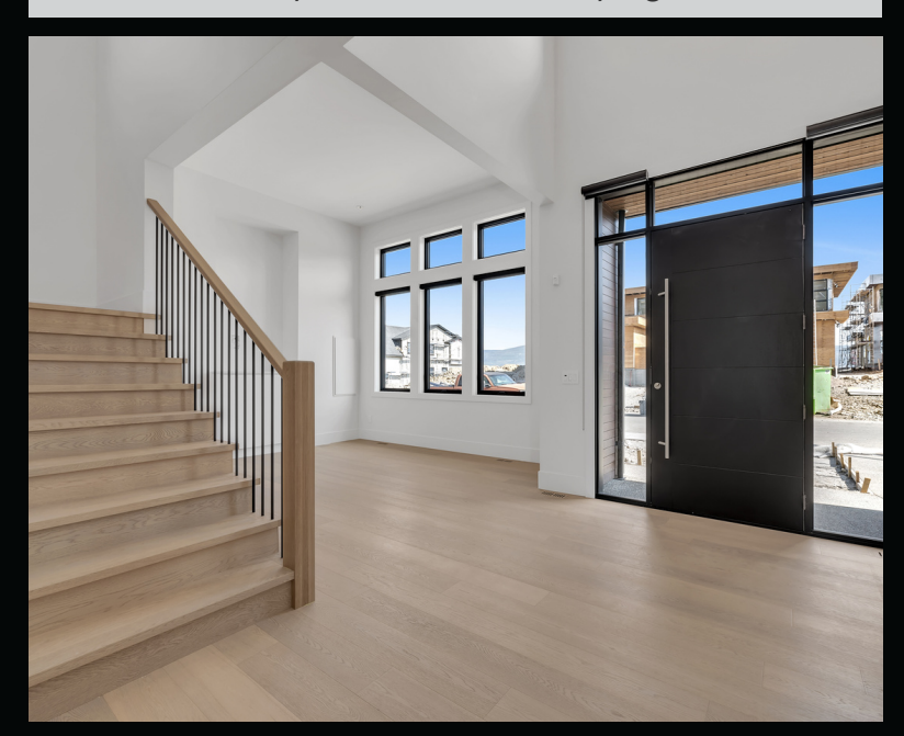
Please Note: information is believed to be from reliable sources; buyers should satisfy themselves as to its accuracy. All measurements are approximate.