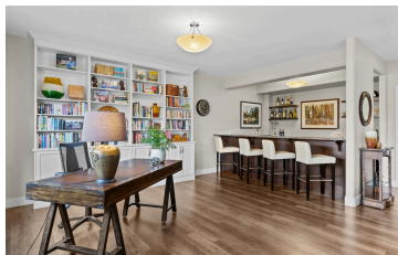
LOWER LEVEL BAR